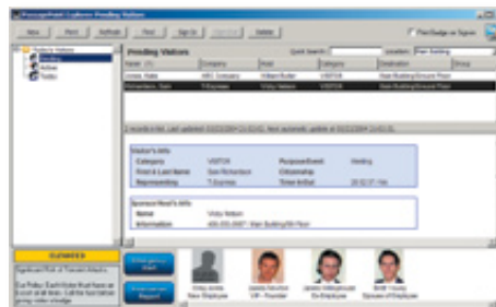
SecureView gives lobby staff a visual alert to undesirable visitors

SecureView is also very flexible. It lets you designate locations for each of your own watchlists, select colors and texts for each level of emergency alert, and author your own security policies and procedures.