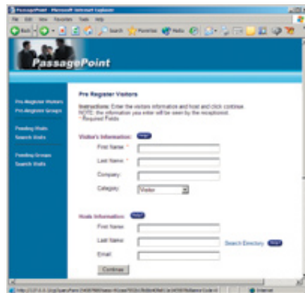
PassagePoint Professional v4.5's Web Pre-Registration module lets employees pre-register visitors